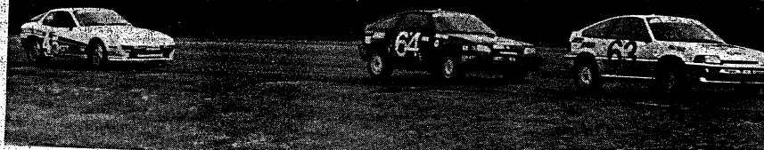
The race finished much better than it started for Team Honda.

SCCA/ESCORT Endurance Championship SportsCar Drivers Cup Standings are not available pending appeals after the Brainerd event.